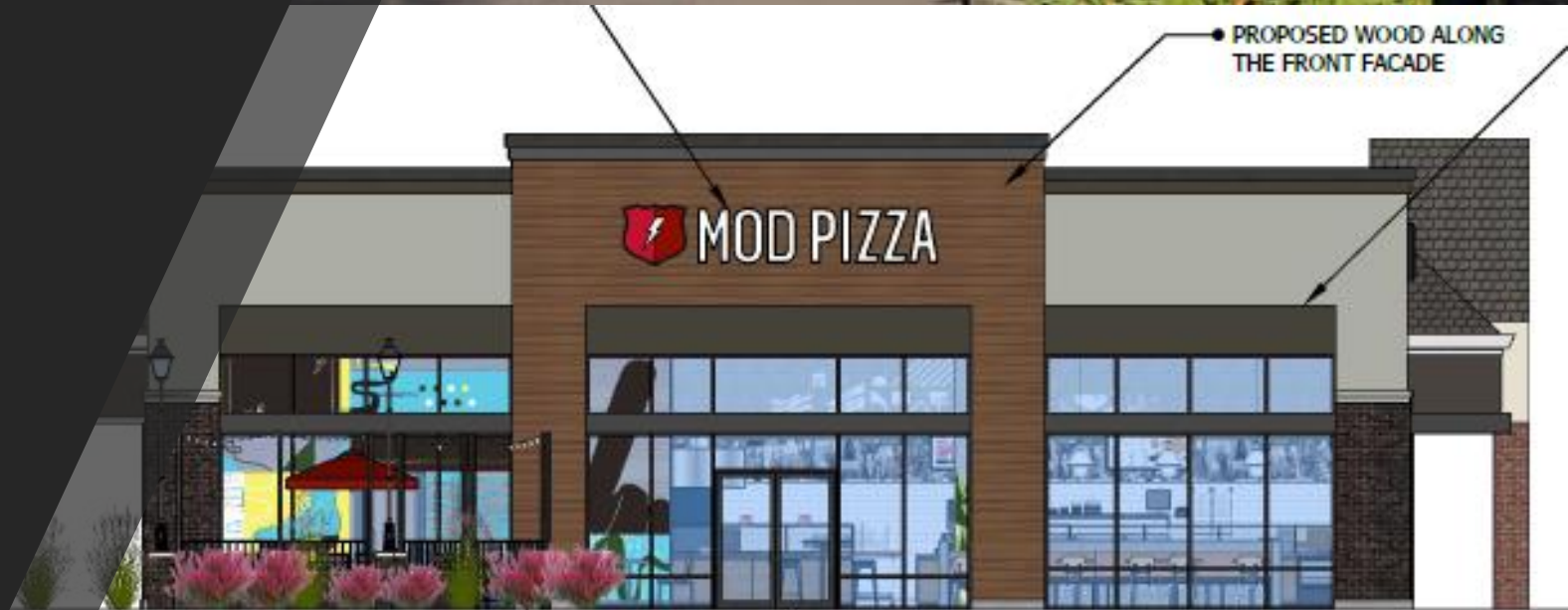
New Look for MOD